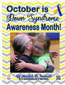
Zig Zag Style

We are excited to spread awareness during October with our Down Syndrome Awareness Month Poster campaign. This year each family will receive one free 11x14 photo poster or $10 off any other size poster or yard sign. You can decide where the posters are displayed, or we can display them locally at businesses, schools and libraries. The choice is yours. There are no limits to the number of personalized posters you or your friends and family can sponsor. There are 3 styles of posters available in 2 different sizes and a yard sign option (yard signs are similar styles printed horizontal and include a stand). Each style can be personalized with a photo of your loved one with Down syndrome. Posters will be processed within one week of final design approval. You will also receive a copy digitally that you can share with friends and family who might also like to sponsor a poster.