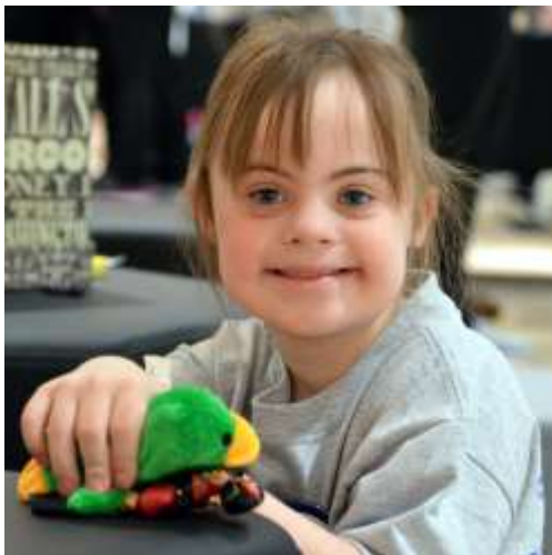
Fun from last year's Star City Buddy Walk.