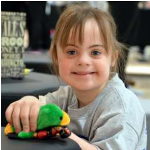
Fun from a past Lincoln Buddy Walk.