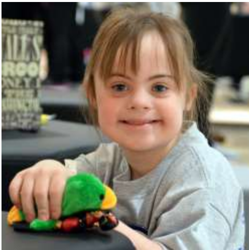
Fun from a past Lincoln Buddy Walk.