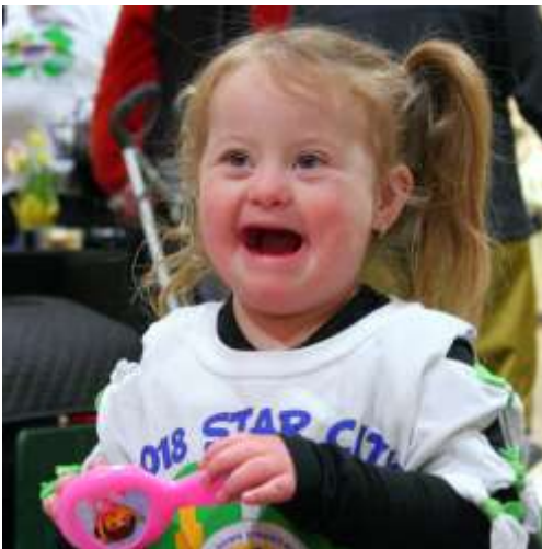
Fun from last year's Star City Buddy Walk.